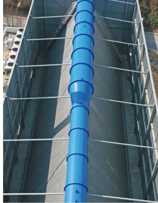
Steam distribution duct

They are constructed with either rugged all steel hot dip galvanised two row tube systems with large size elliptical fin tubes or high efficiency aluminium finned single row tube systems with flat type carbon steel steam channels. In any case the unique GEA single-pressure, two-stage condensing process minimizes sub-cooling, corrosion and freezing risks. If you face problems of scarce water supplies, zero blowdown requirements or community and aesthetic concerns, a GEA air cooled condenser may be the most economical solution. It may also be the only solution that will allow your plant to be built at all.