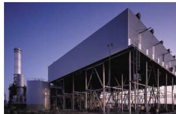
One of the biggest air cooled condensers for combined cycle power plants was installed in Corby, Great Britain. Turbine output is 120 MW.