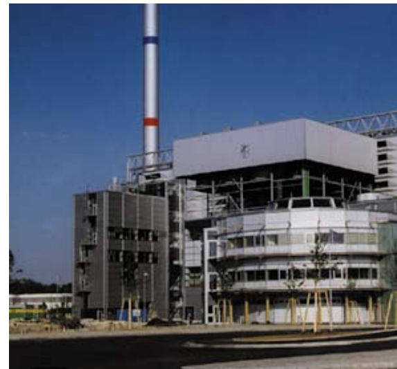
ACC located on top of a turbine building