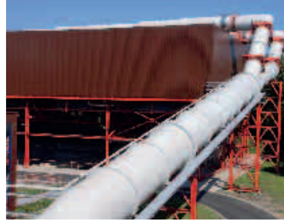
Inclined exhaust steam duct Waste To Energy Power Plant Bielefeld, Germany

The advantages of the V-structure, which satisfies strict noise emission requirements, are compelling.