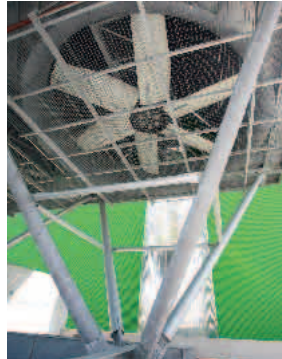
Bionic design Waste to energy power plant Herten, Germany