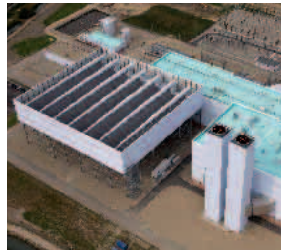
Air Cooled Condenser for combined cycle power plant Livorno, Italy E.on Produzione Centrale Livorno Ferraris