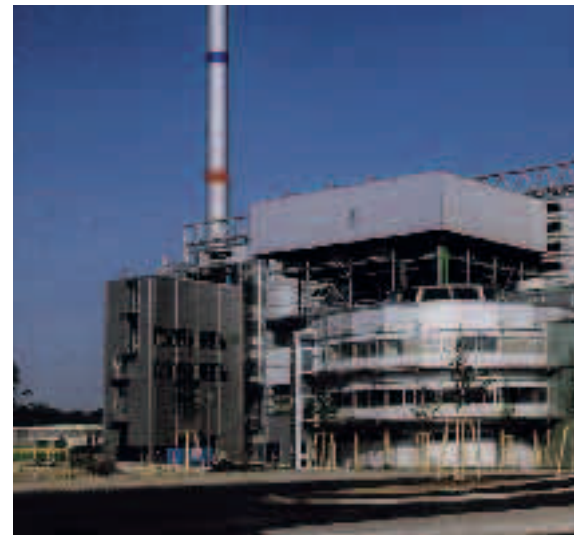
ACC located on top of a turbine building